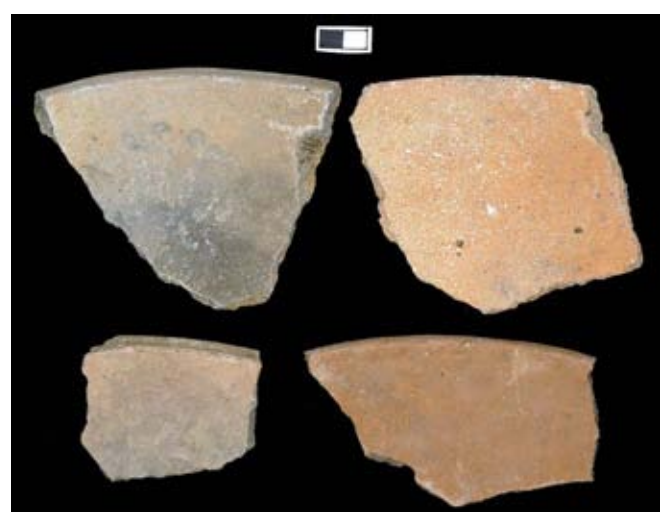
Figure 3. Comales , or tortilla griddles, from Pusilhá. This form is not found at Uxbenka or Lubaantun, suggesting that there were significant differences in food preparation practices within southern Belize during the Late Classic period.

from Pusilhá - with the exception of one vessel - lack connections to Honduras and El Salvador. This may in part be due to surface preservation; materials from Pottery Cave are remarkably preserved while ceramics from most other contexts at the site are not. An interesting feature of the Late Classic and Terminal Classic ceramic assemblage is the presence of comales (Figure 3). These are relatively common at Pusilhá and at sites in the Upper Pasion Region and the Dolores Valley to the west. They are not described for nearby Lubaantun, have not been found at Uxbenka (Andrew Kindon, personal communication 2007), and are generally uncommon, rare, or unknown in the northern Petén. The presence of comales at Pusilhá and in parts of the southern Petén may indicate that a distinct food-way was practiced in this region. Moreover, the marked difference in this regard between Lubaantun/Uxbenka Pusilhá and indicate that in ancient times, identity in Toledo District was as complex as it is today.