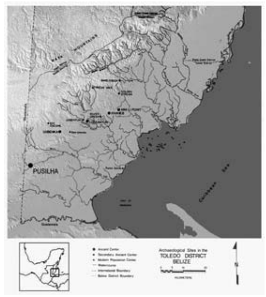
Figure 1. The Southern Belize "Region," showing principal archaeological sites dating to the Classic period.